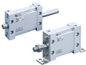
Plate Cylinder MU/MDU